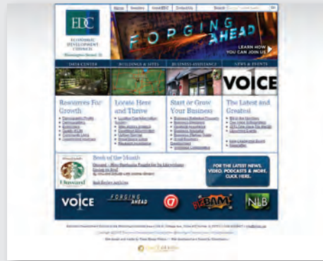
www.bnbiz.org Web site