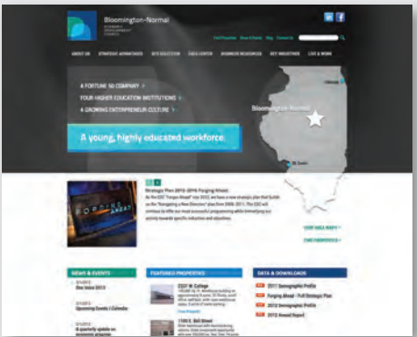
www.bnbiz.org Web site